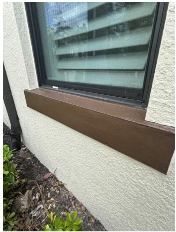
Figure 3: Paint application was completed on the brown window ledges.