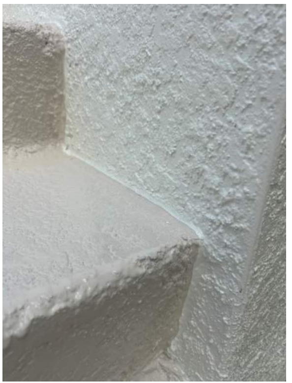
Figure 9: Stucco to stucco sealant application was completed from treads/risers to the wall of the staircases in front of the building.