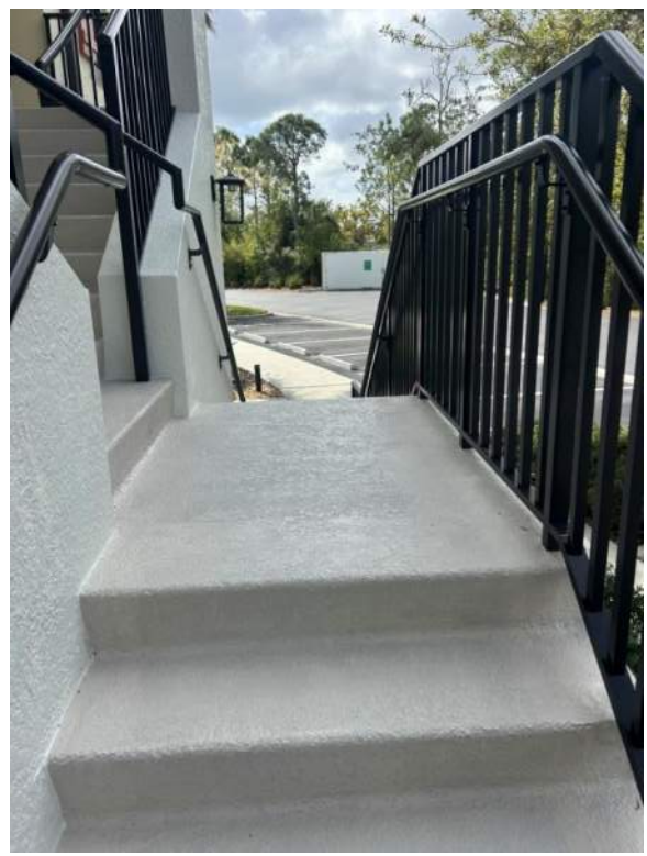
Figure 13: Crack repair was completed on the level 1 stair landings of both staircases in front of the building.