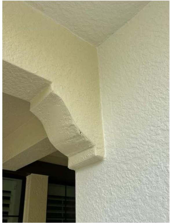
Figure 10: Stucco to stucco sealant application was completed around all corners and decorative bands.