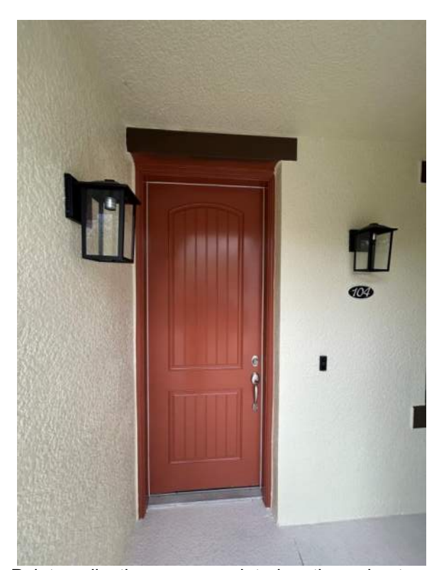
Figure 4: Paint application was completed on the red entry unit doors.