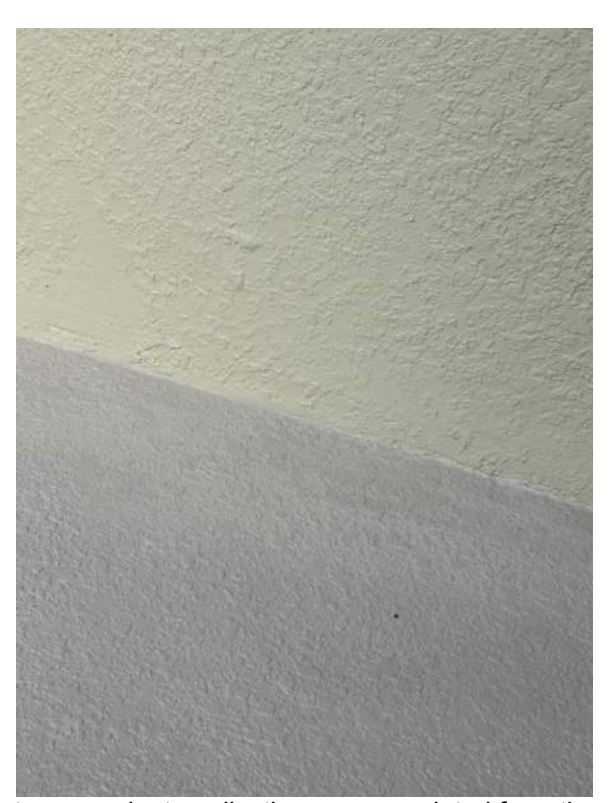
Figure 12: Stucco to stucco sealant application was completed from the walkway floor to wall.