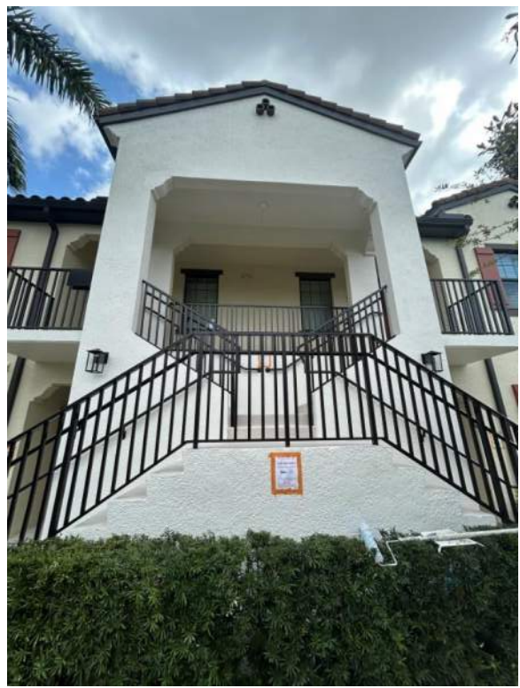
Figure 1: Paint application was completed on the exterior wall of the building.