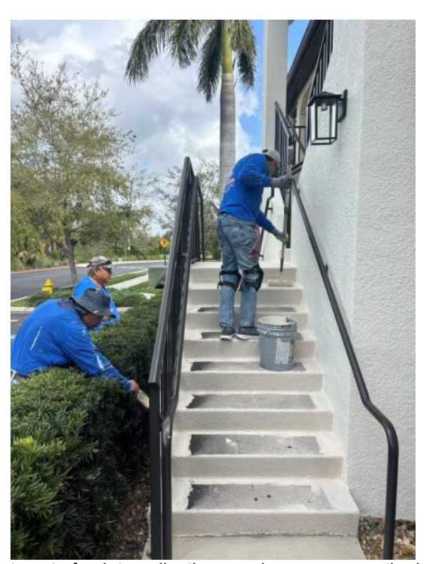
Figure 6: First coat of paint application was in progress on the left staircase.