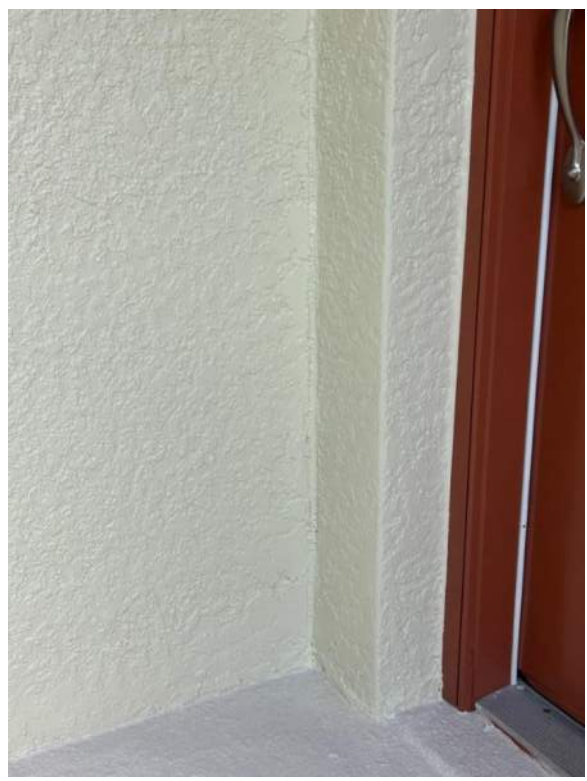
Figure 11: Stucco to stucco sealant application was completed on the vertical transitions of the building.