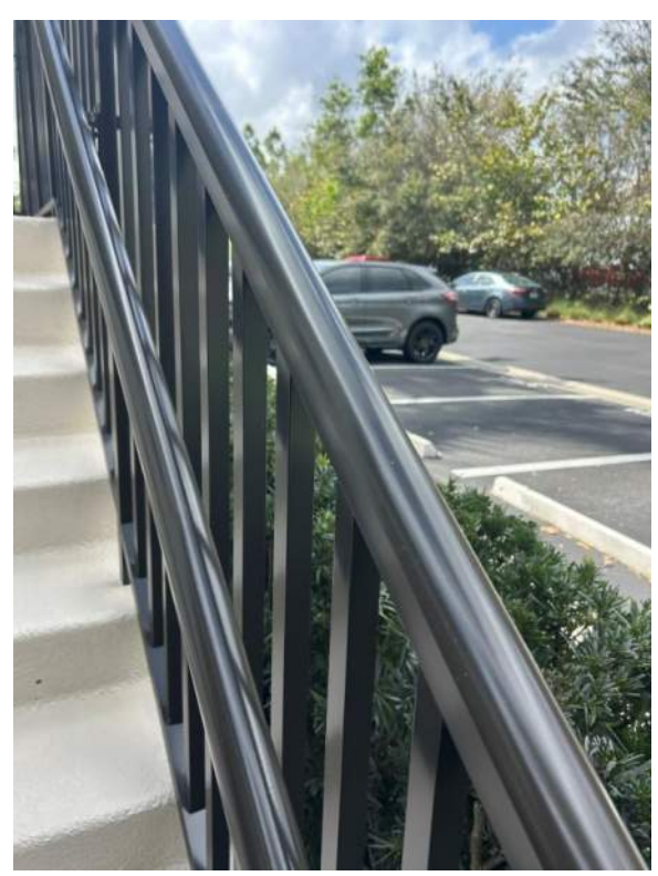
Figure 5: Paint application was completed on the guardrails of both staircases.