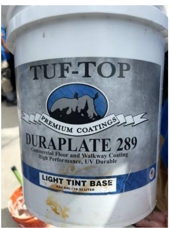
Figure 8: Tuf-Top Duraplate 289 was observed on site for paint application on stairs.