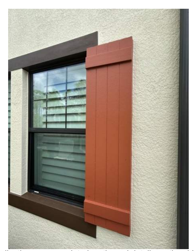
Figure 2: Paint application was completed on the red details on the sides of the windows.